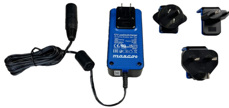
100-55-0028 Spare Battery Charger