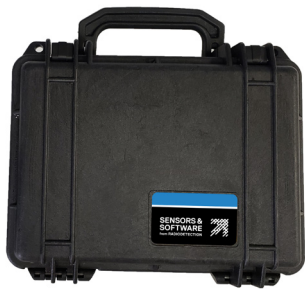
100-55-0023 Spare Battery