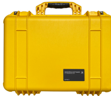
100-60-0066 Deluxe Display Unit Carrying Case