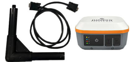
100-54-0160 LMX-SG Package 100-54-0160-RTK LMX-SG with RTK Package 100-22-0124 Geode RTK Upgrade