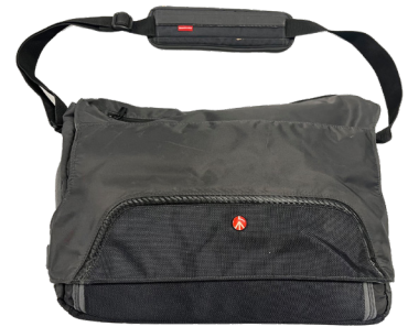
100-60-0059 Soft-sided Display Unit & GPR Accessories Carry Bag