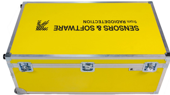
100-60-0058 LMX® Series ATA Shipping Case (includes 100-60-0059 DVL Bag)